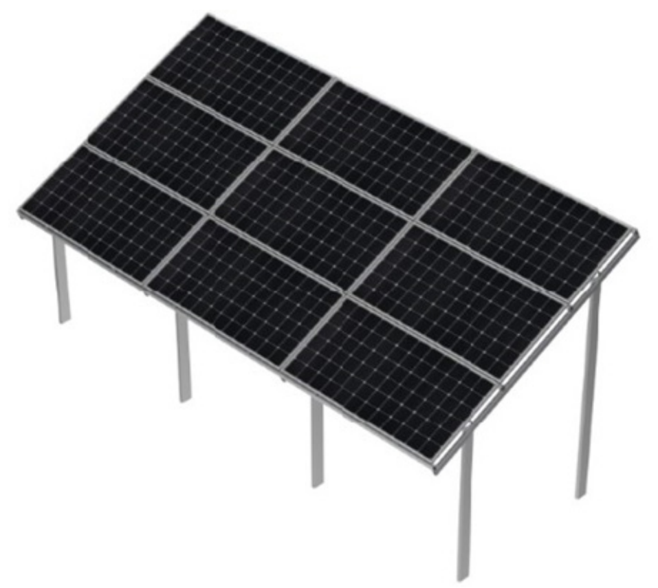
Arrangement for bifacial modules over 1070mm in width