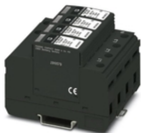
Surge protective device, 4-channel (in 3+1 circuit), for installation on NS 35/7,5 voltage: 230 V AC

Please be informed that the data shown in this PDF Document is generated from our Online Catalog. Please find the complete data in the user's documentation. Our General Terms of Use for Downloads are valid ( http://phoenixcontact.com/download )